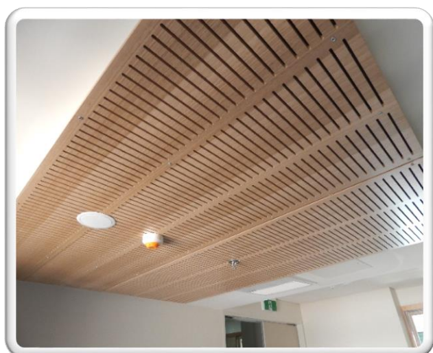
Pictured- MDF Veneer