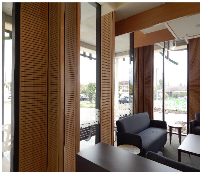
Pictured – Acoustic MDF Veneer Wall Panel