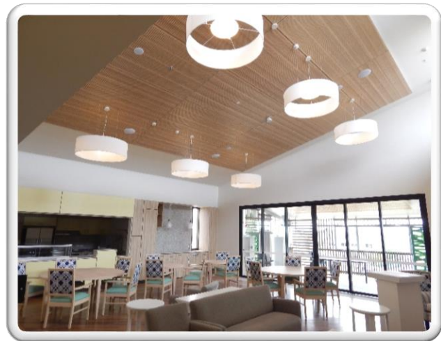
Pictured – MDF Veneer